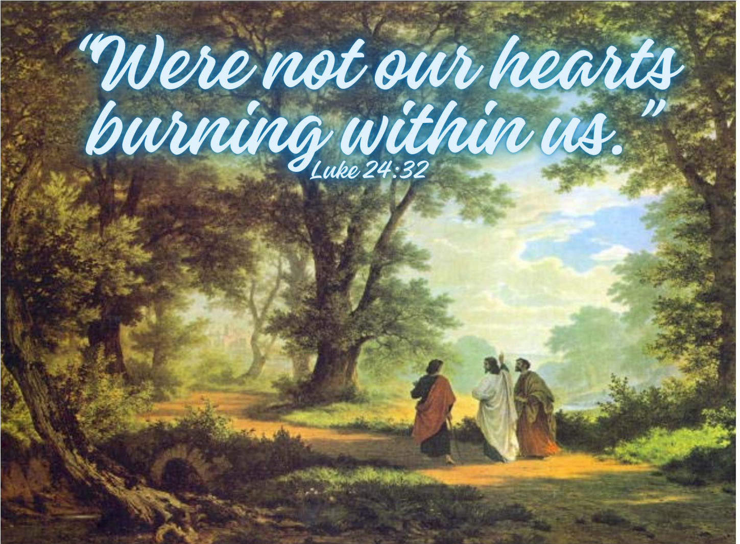
Robert Zünd, Way To Emmaus , 1877

"Were not our hearts burning within us." Luke 24:32