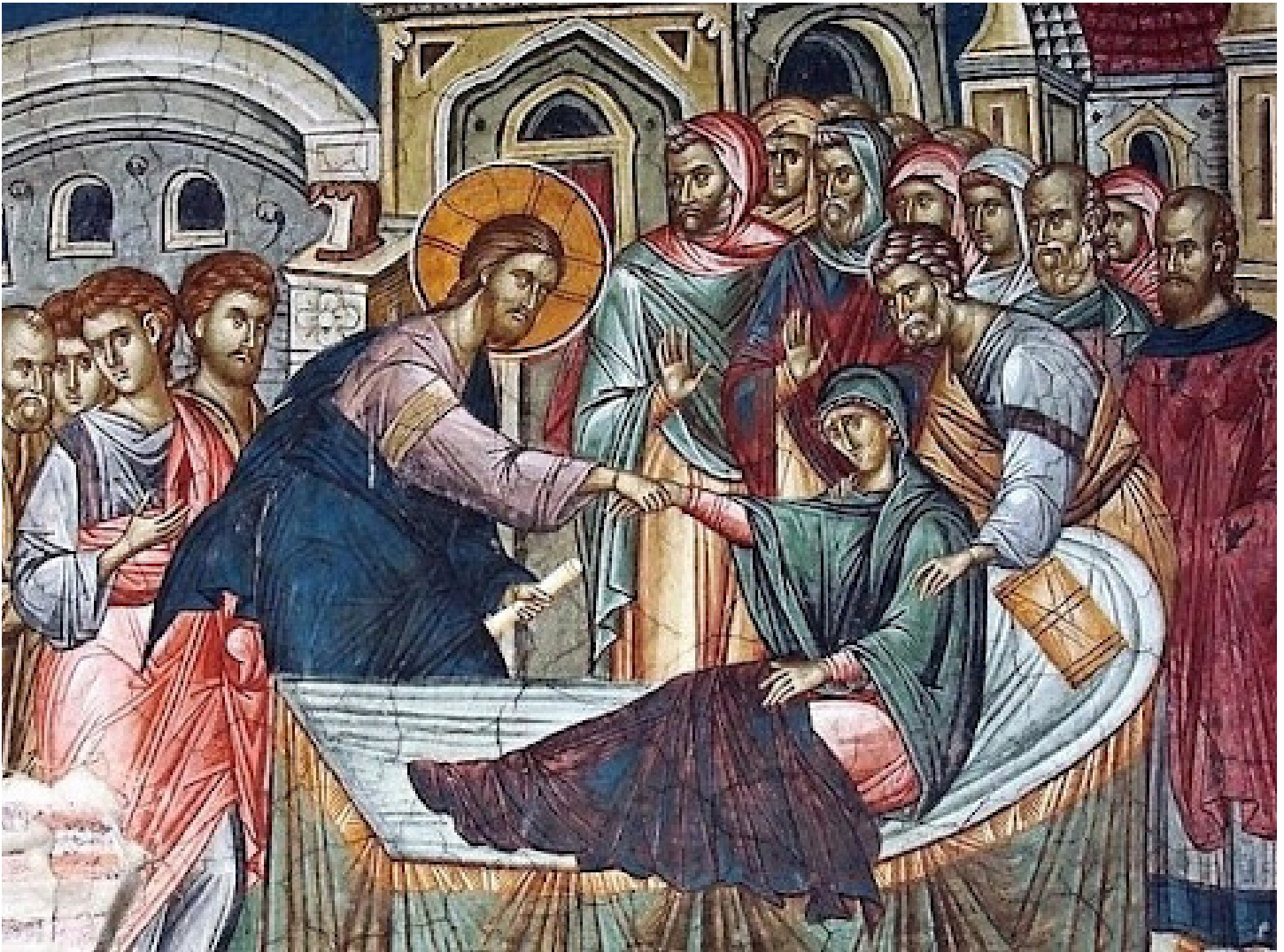
MONASTERY DECANI, SOUTH WALL, CHRIST'S MIRACLES (59) – CHRIST HEALS PETER'S MOTHER IN LAW

FEBRUARY 4, 2024 + FIFTH SUNDAY IN ORDINARY TIME