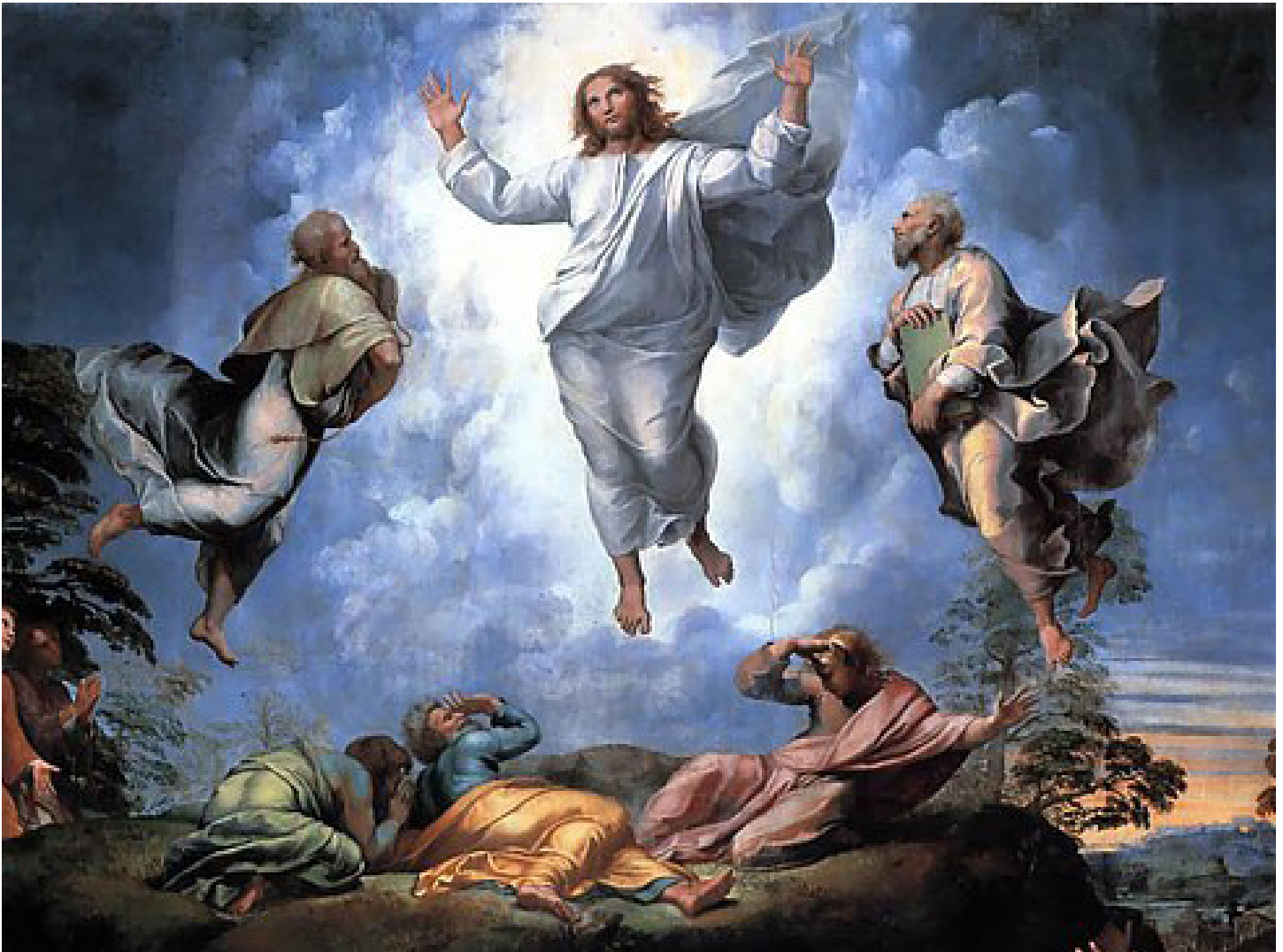
THE TRANSFIGURATION, RAPHAEL, 1516-1520

AUGUST 6, 2023 + FEAST OF THE TRANSFIGURATION OF THE LORD